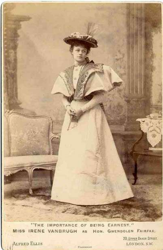
"THE IMPORTANCE OF BEING EARNEST." MISS IRENE VANBRUGH AS HON. GWENDOLEN FAIRFAX.

the growth of the flared skirt which grew to its widest extent in 1895 when they were known as 'the bell', 'the fan' and 'the umbrella skirt'. In an essay on costume of the period James Laver remarks, "It is impossible to put a photograph of a fashionable woman of 1895 beside a photograph of a lamp of the same period without being struck by their close resemblance in every detail. The unmistakable sweep of the Art Nouveau line was completely parallel in the dresses of the time, in particular by the fall and swirl of the skirt."